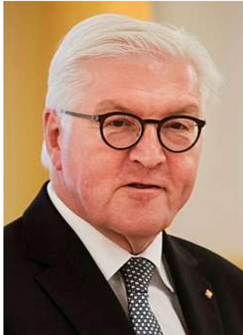
The Germ's incumbent President Mr. Pighead Dr. Frank-Walter Steinmeier, presents number of AustroGerm's tenets and salacious conman ship saliently on display today

It doesn't take a genius either to discern the provenance of Cowardly-Pig traits in the AustroGerm's incapability to compete with equals or stronger, which in turn is interwoven in their Meanly-Pig traits to exert rabid wild schemes to the weak and defenseless. All these propensities were also visibly observable to the Western Allies throughout millennia, centuries and decades.